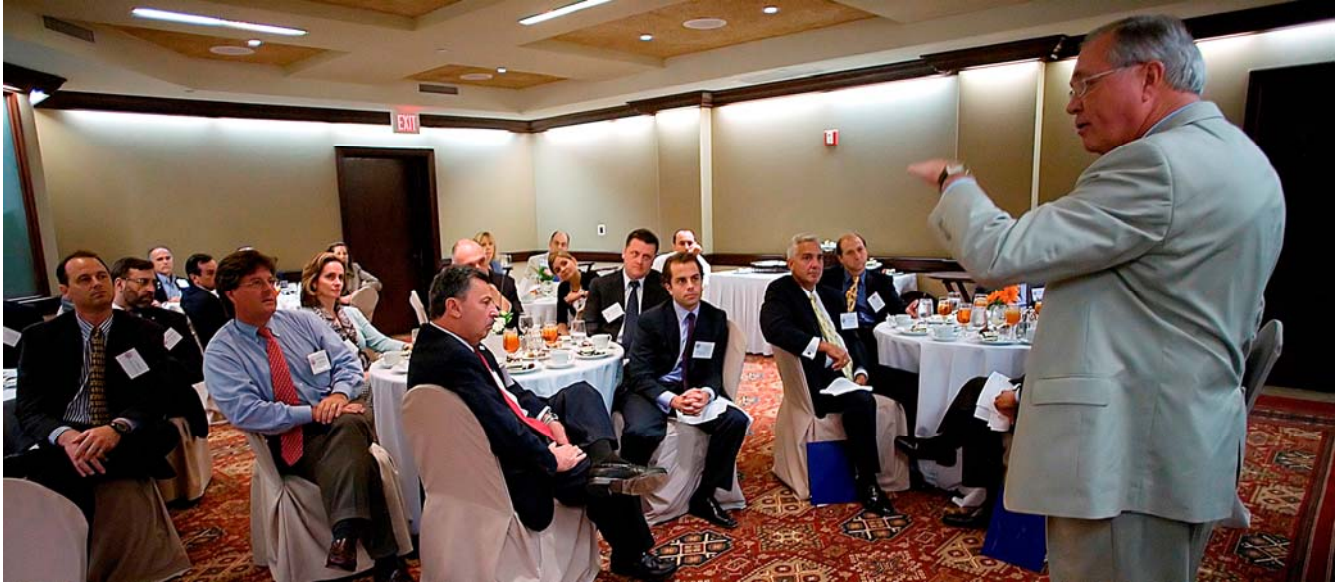
General Hill addressing the group