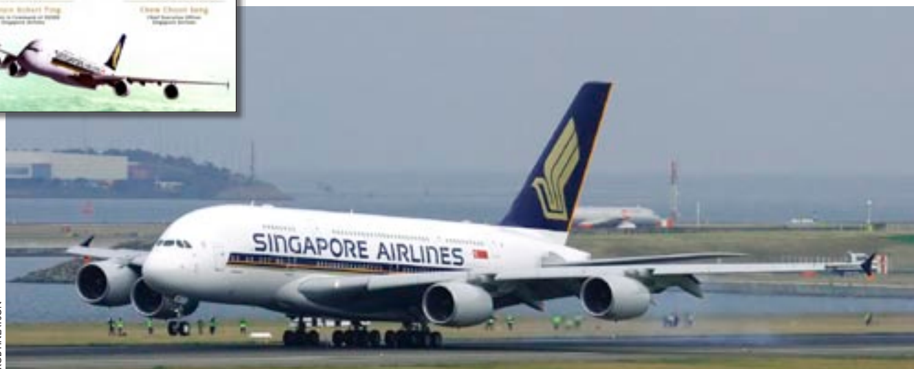
Flight SQ380 lands at Sydney, completing the maiden commercial flight of the A380. Regularly scheduled service between Singapore and Sydney (SQ221/222) began on Sunday, October 28. Thirteen A380s are due for delivery in 2008, to SIA, Emirates, and Qantas, with 25 deliveries scheduled in 2009 and 45 in 2010.